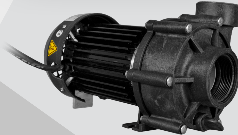
DC MOTOR VARIABLE SPEED PUMP